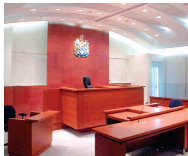
Ottawa courthouse, millwork consultancy to Crain Limmert Architects

that he can also meet the needs of non-profits and smaller companies where budget issues are important and resources must be managed carefully.