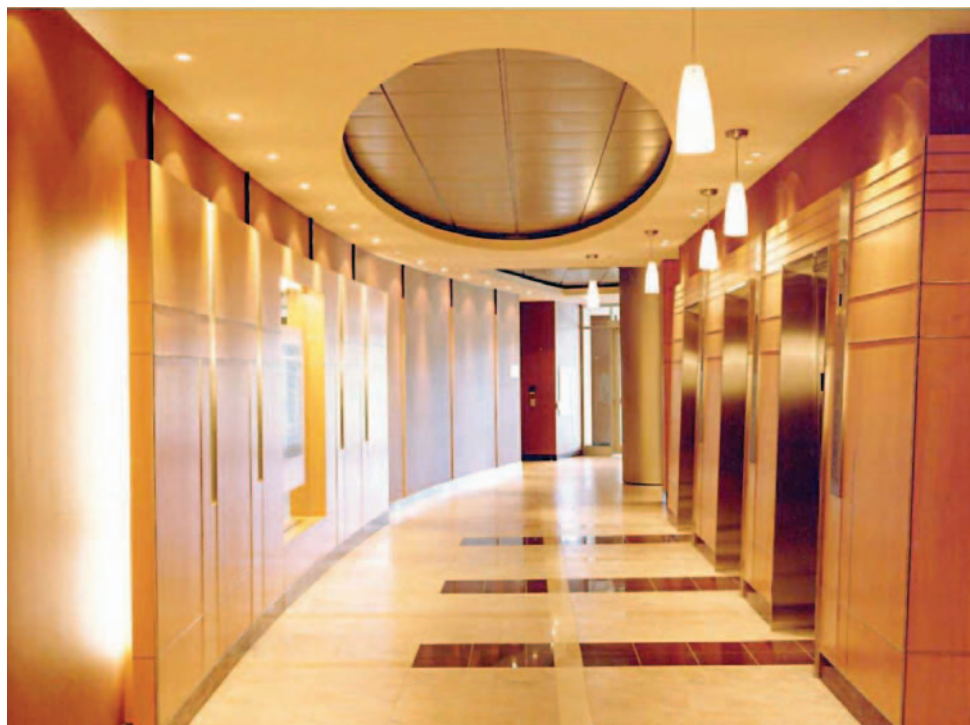
411 Leggett Drive lobby, Kanata, detailing consultancy to Griffiths Rankin Cook Architects