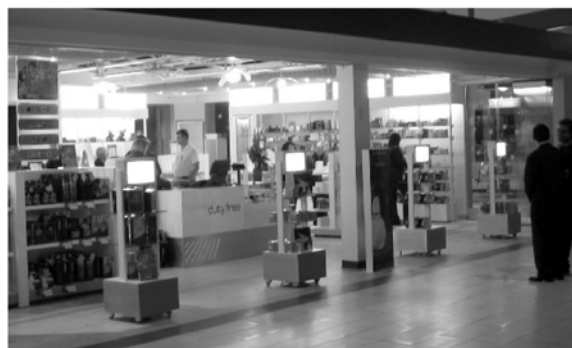
Runway Duty Free - Ottawa Airport