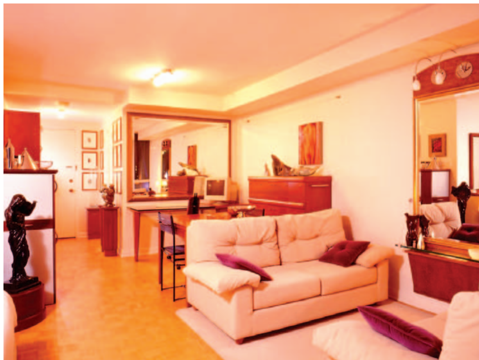
Private residence, Ottawa, photo Taylor Photography