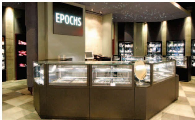
Epochs, Rideau Centre, Ottawa