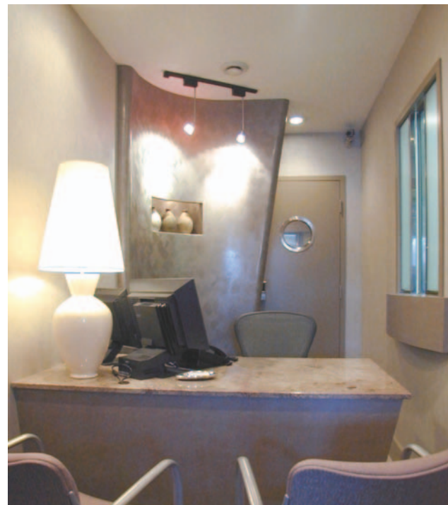
Accu-Rate Gold Room, Ottawa