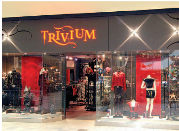
Trivium, Rideau Centre, Ottawa