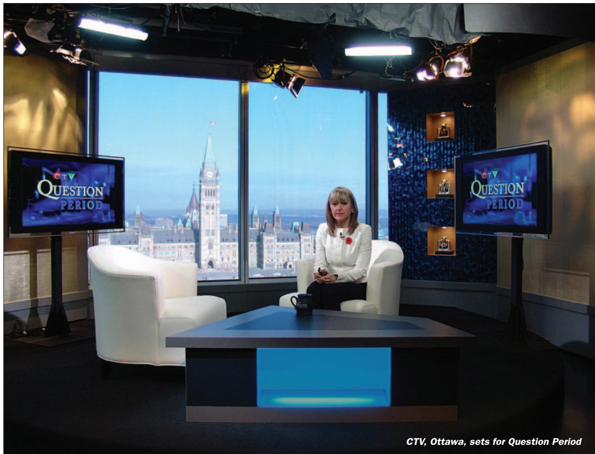
CTV, Ottawa, sets for Question Period