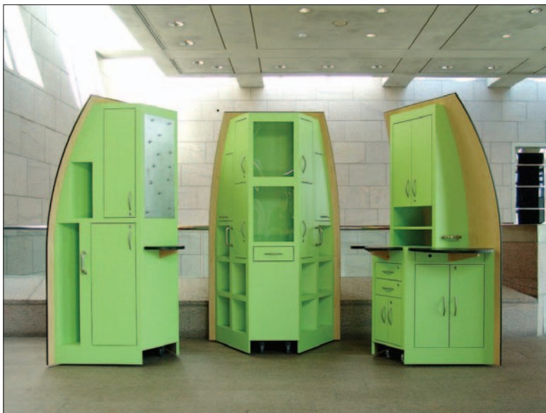
National Gallery of Canada, Artissimo kiosks, with NGC Design Services, fabricators LTR Industries