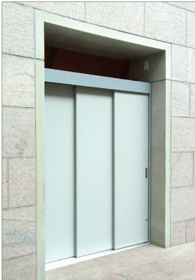
National Gallery of Canada, temporary protective works, with NGC Design Services, fabricators ECR