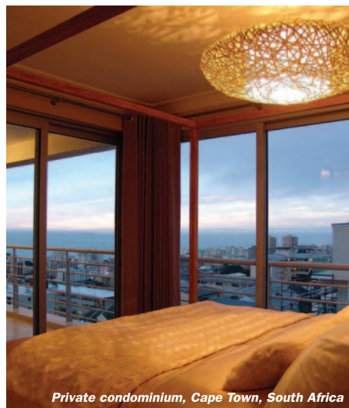
Private condominium, Cape Town, South Africa