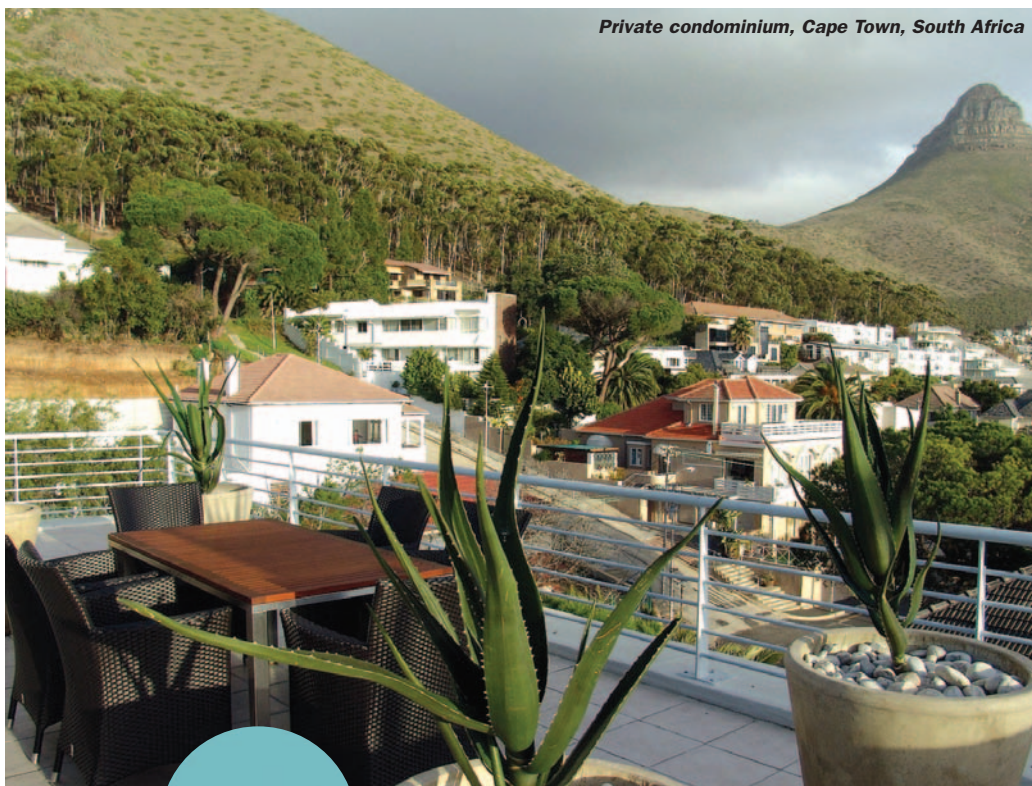
Private condominium, Cape Town, South Africa

Clients, colleagues describe attention to detail and respectful relationships