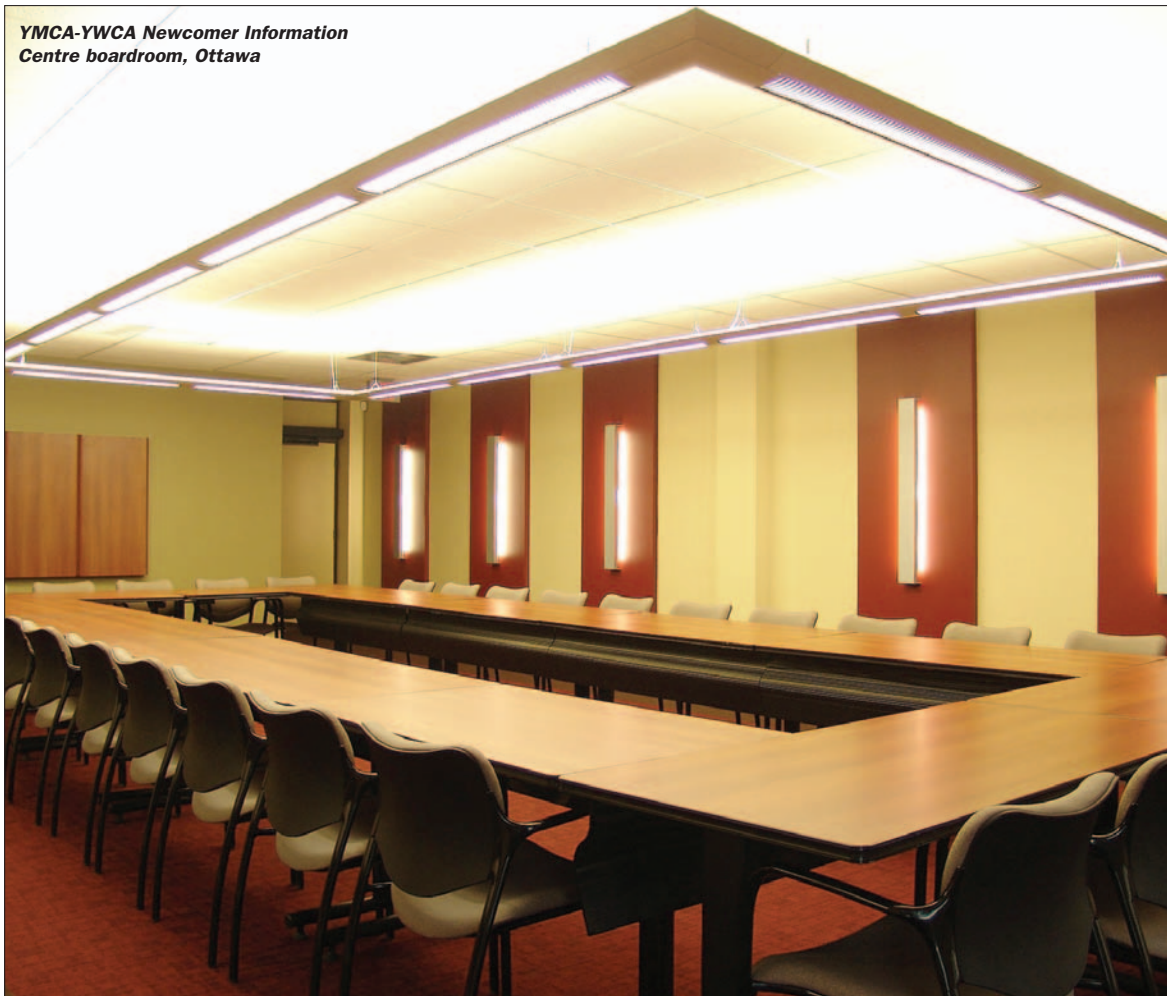
YMCA-YWCA Newcomer Information Centre boardroom, Ottawa