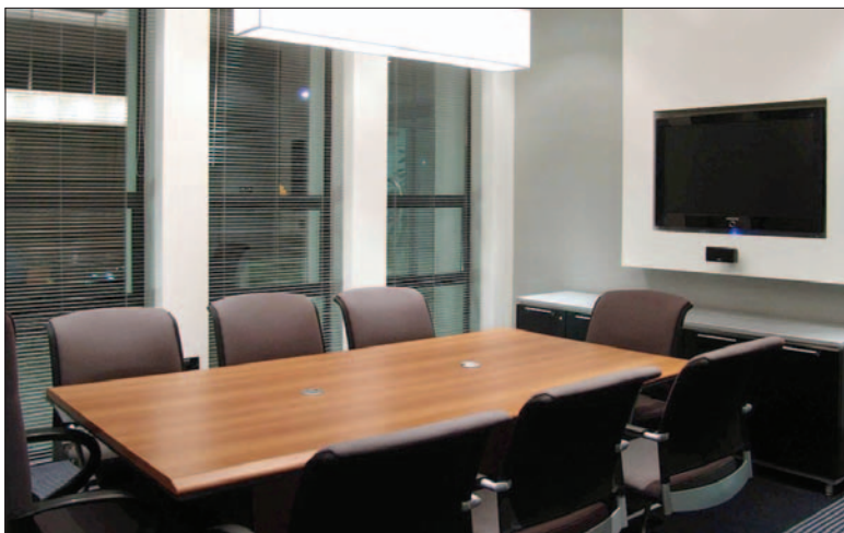
Pacnet (Europe) Ltd., Shannon, Ireland, new boardroom