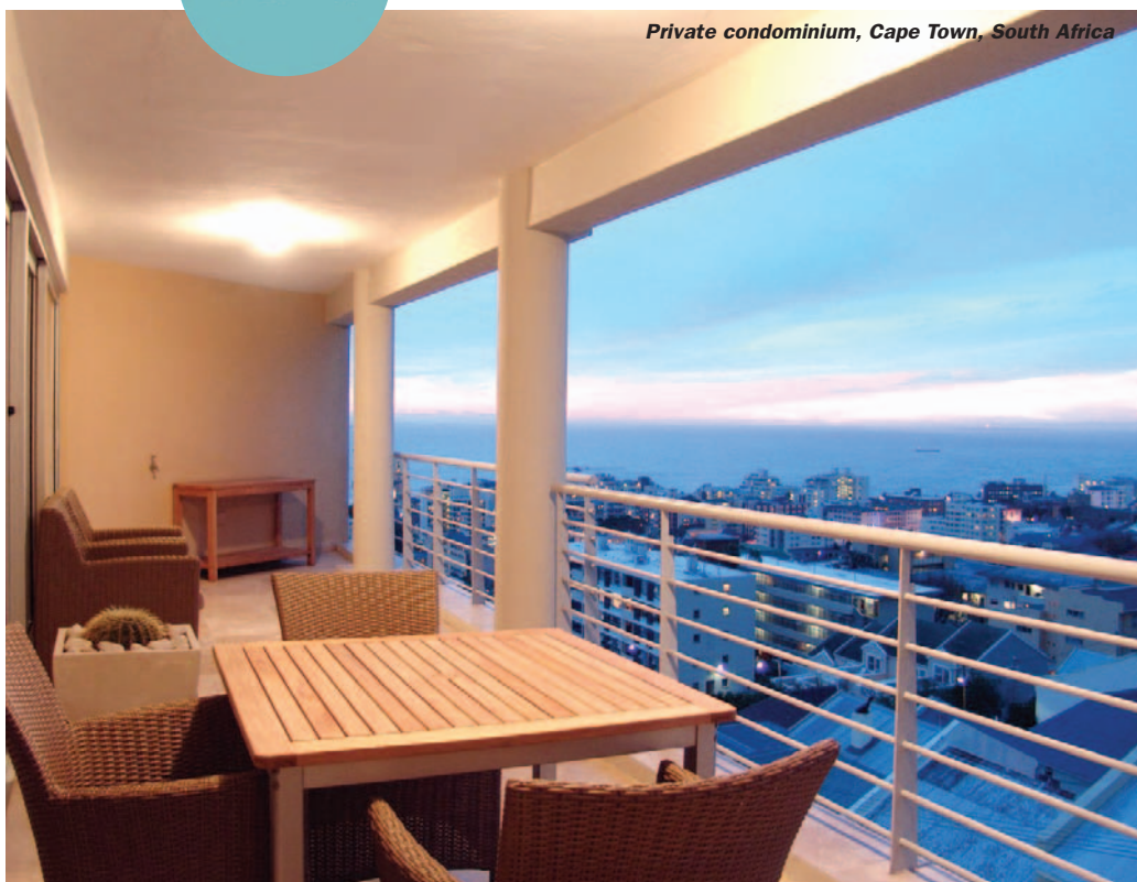
Private condominium, Cape Town, South Africa

STAFF WRITER – The Ottawa Construction News