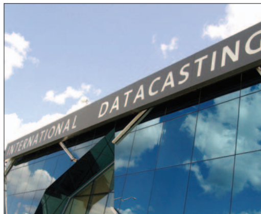
Signage for International Datacasting, Kanata, fabricators JBL Signs

For international projects, "we do a research visit where we measure and look at the property in detail and